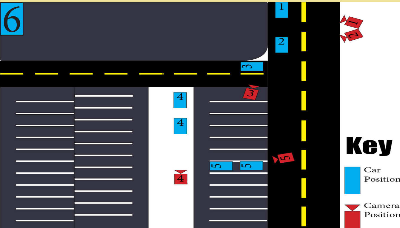
This is a diagram of what the final product would look like.