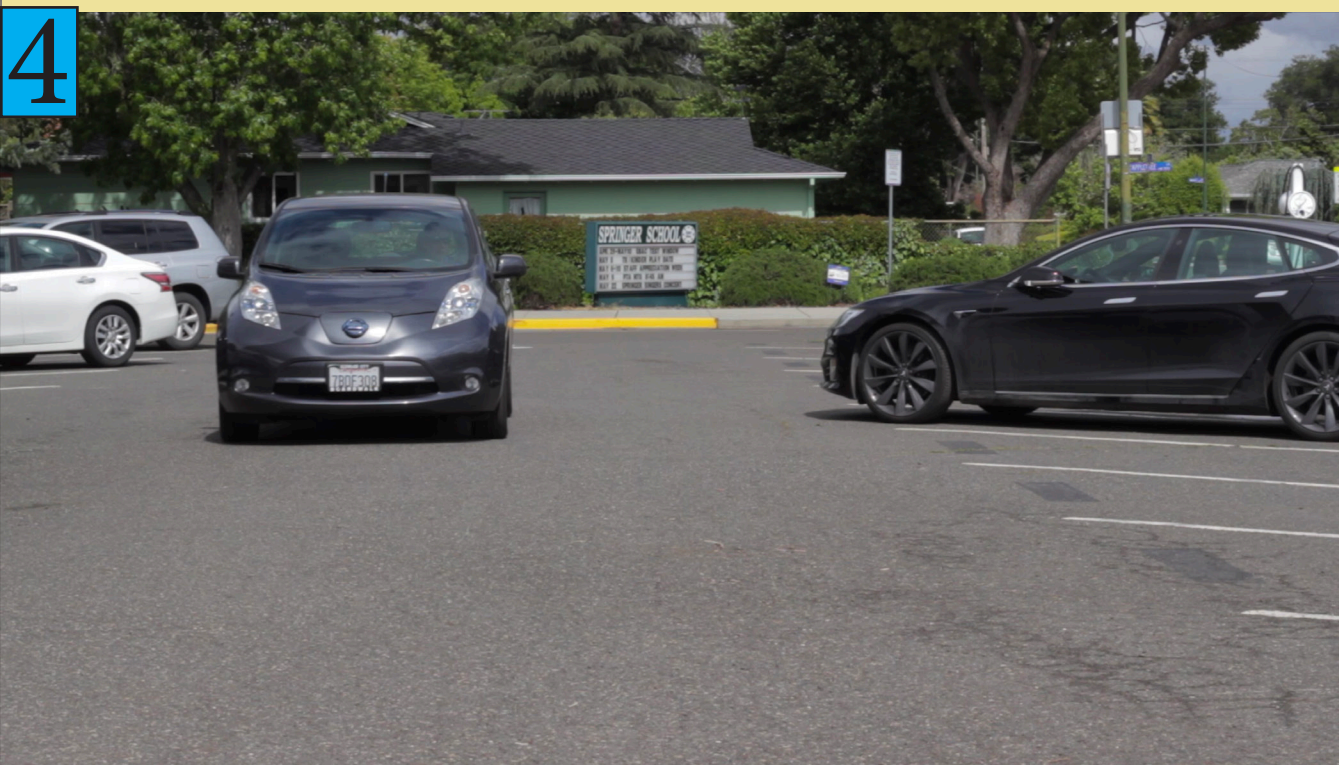
A head on shot is important to include in your vehicle scene, which will usually end with the car driving past the camera or turning.