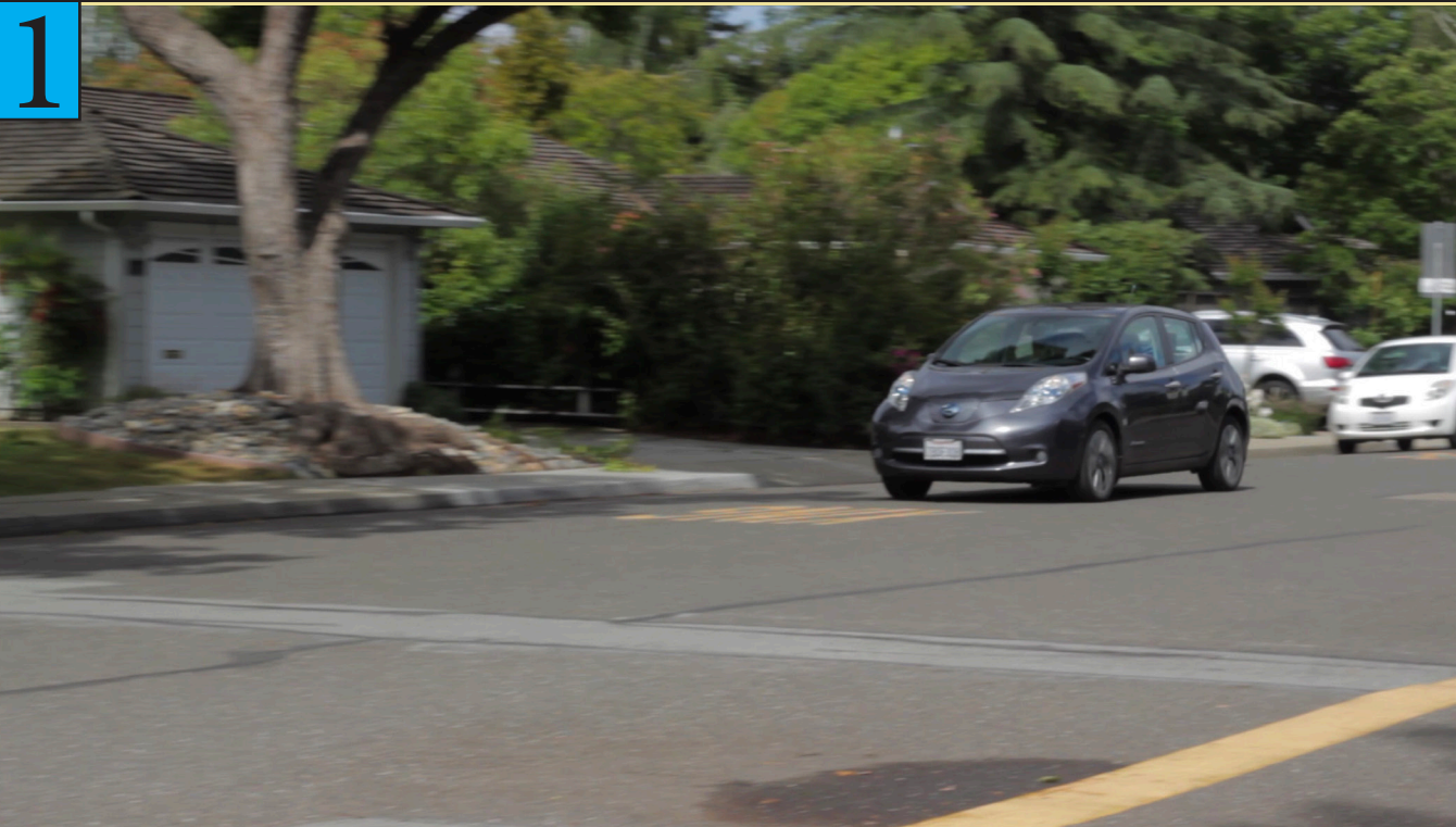
Always have a pan, while the car moves from one one side of the frame to another. Never have this shot be a straight horizontal line.