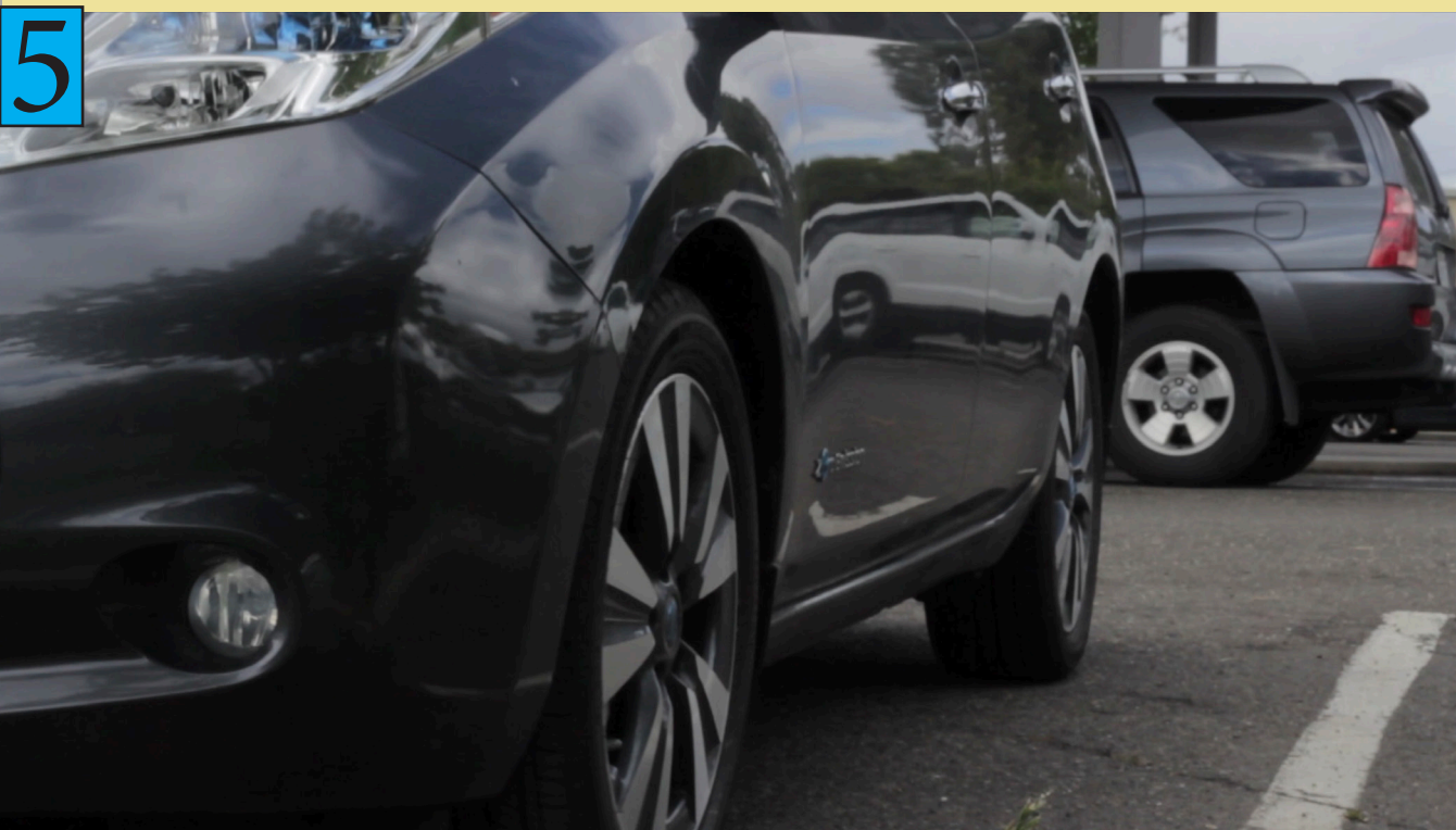
It is important to show that the car has stopped its turn and parked. Staying on the same side, following the 180 degree rule, show that the car is stationary.

Keep these tips in mind the next time you are filming a vehicle in motion!