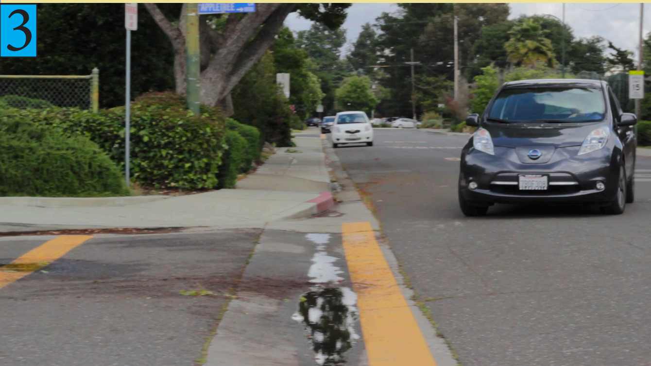
Always remember to follow the 180 degree rule on turns, meaning that the camera should always stay on one side of the vehicle.