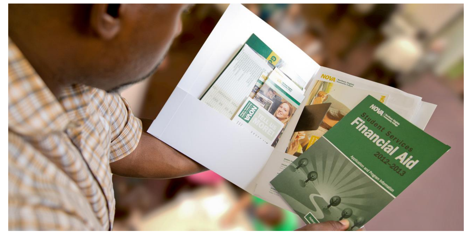
Financial aid packet offers hard-working student a generous $21 per year.