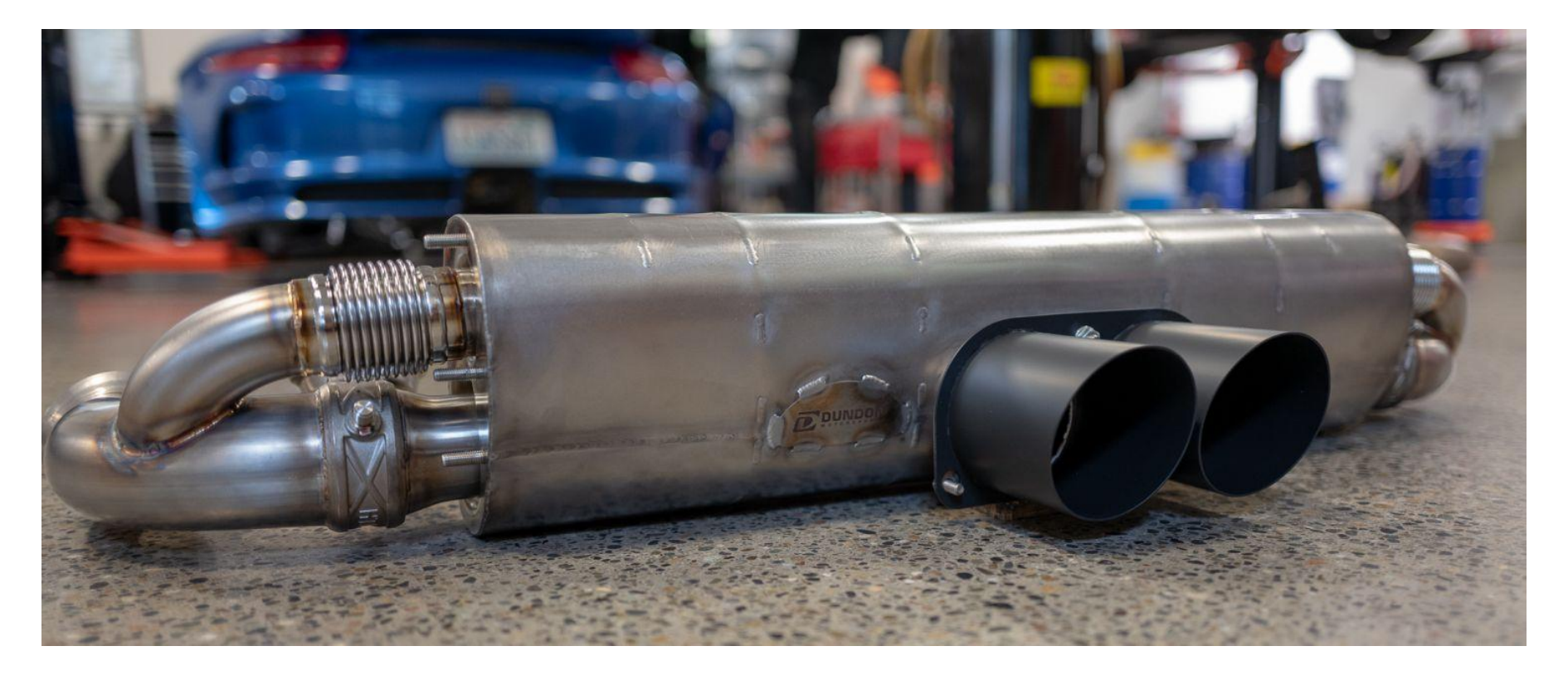
Study shows direct correlation between removing your muffler and a false sense of superiority.