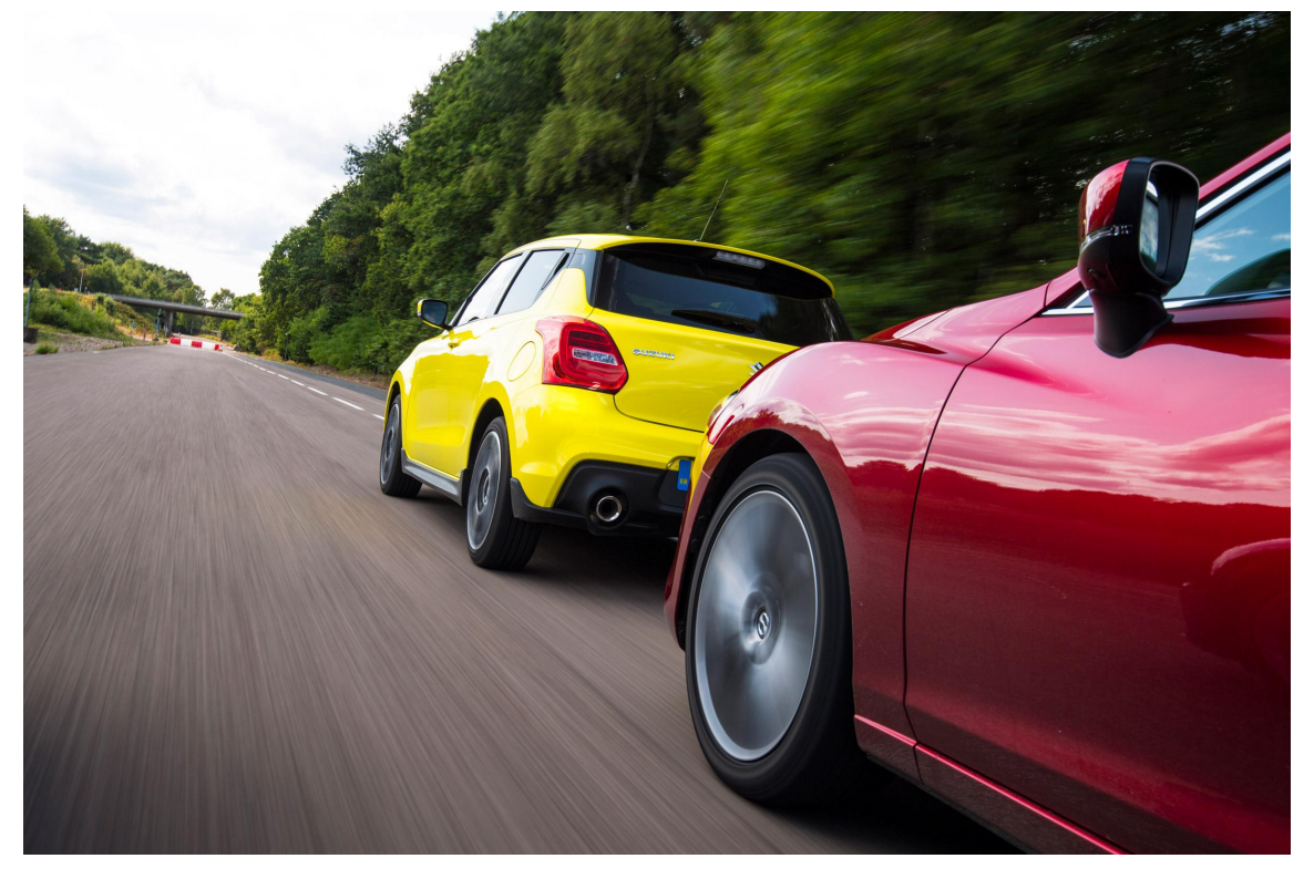
Person in the car in front of you still only going 50 in a 25 zone after being tailgated for two blocks.